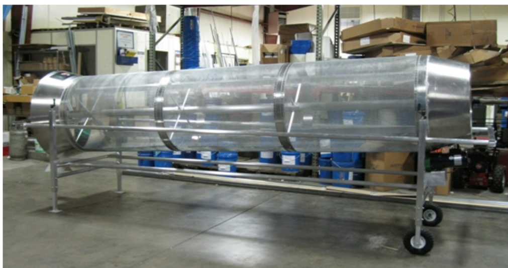
Standard 3634 Equipped with a Variable Speed Motor