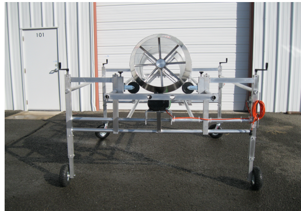
Wide Frame 2420 with Straight Mount Tires on Input End (Standard) & Swivel Tires on the Output End and Diverter