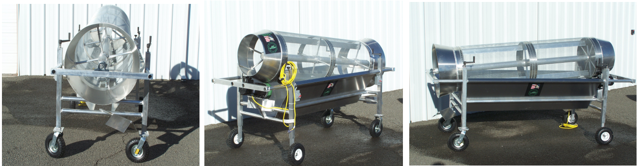
2420 With Side Panels