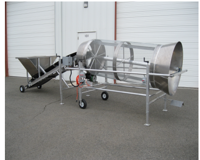
3620 With a Chute, Hopper and Swivel Wheels on Output End