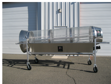
3630 with Side Panels and Swivel Tires on all Legs